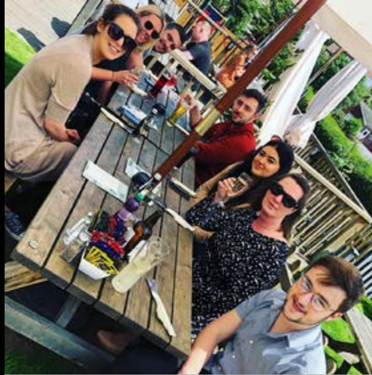
Pub lunches & incentive trips

As your skills develop, you will build your business through your contacts and relationships. Depending on your individual strengths and motivations a unique career path is crafted for you, triggered by promotion milestones and personal achievements.