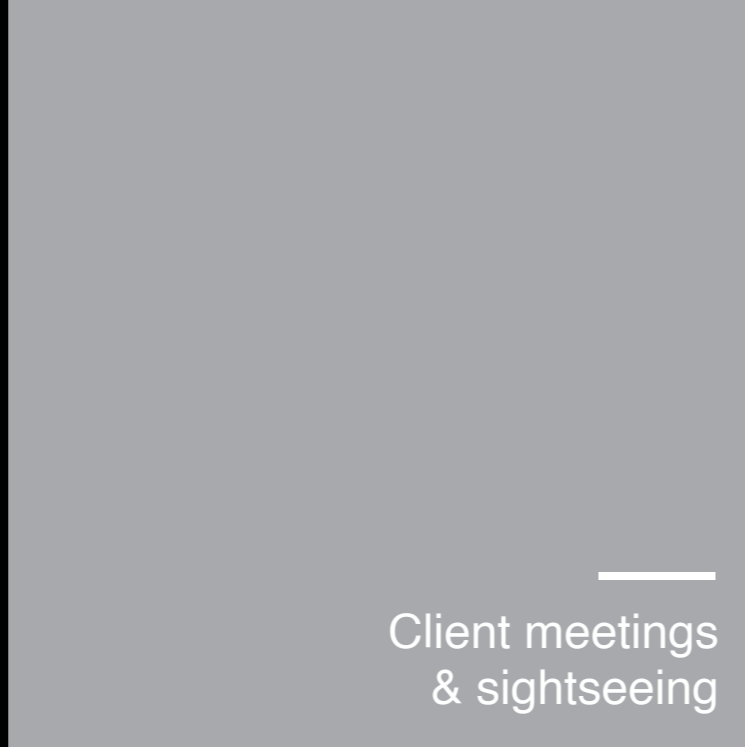
Client meetings & sightseeing