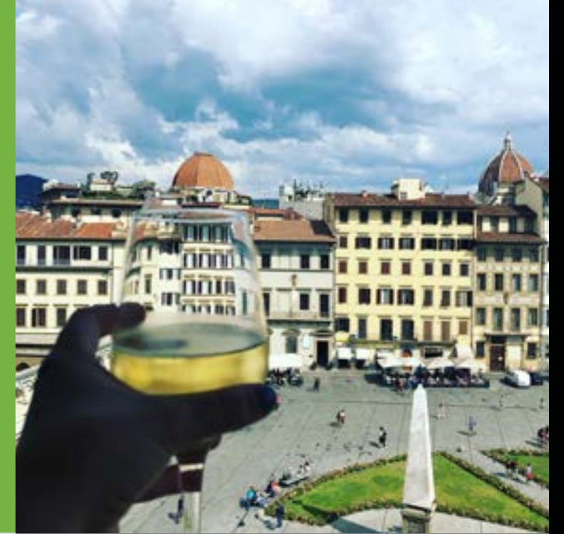
Charity fundraising events